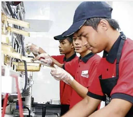
Many locals, especially youngsters, have shown keen interest to take up jobs in fast-food eateries.

They could revolutionise potong rumput and turn it into a major economic activity, one which employs a huge workforce of skilled grass-cutters with knowledge of lawn care and landscaping.